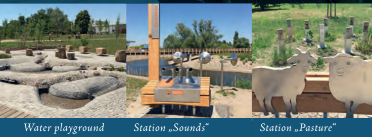
Water playground Station „Sounds“ Station „Pasture“

The open-air area stages a river floodplain in a narrow space. From the sandy shores of the Havel, the path leads through meadows covered with softwoods to higher areas, where tree species of the hardwood forest shape the picture.