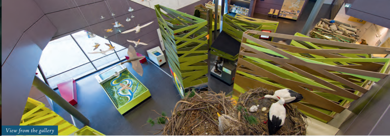
View from the gallery

You can observe the migrating birds from the gallery. You can delve into the history of the city with the view of the Hanseatic city Havelberg. As a moderator and viewer at the same time, you can discuss nature conservation topics with our talk show guests. Finally, test your knowledge in a quiz or enjoy the panoramic view of the floodplain landscape with relaxing sounds.